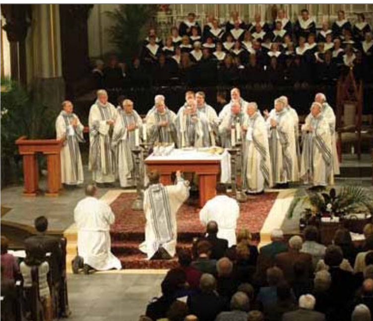
the chalice during the liturgy of the Eucharist at the 2009 Chrism Mass Mass the chrism and other oils are blessed by the bishop and the priests estly service.