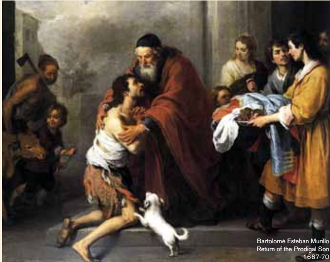
Bartolomé Esteban Murillo Return of the Prodigal Son 1667-70